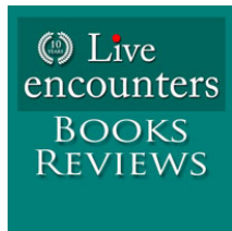
( https://liveencounters.net/2020/07/24/live-encounters-books-august-encounters-books-august-encounters-books-august-encounters-books-august/ )