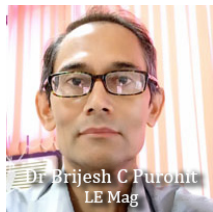
( https://liveencounters.net/2020/07/30/live-encounters-magazine-august-encounters-magazine-august-encounters-magazine-august/ )