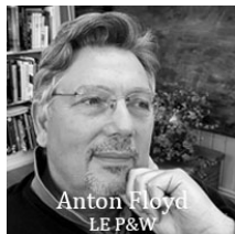
( https://liveencounters.net/2020/07/27/live-encounters-poetry-writing-encounters-poetry-writing-encounters-poetry-writing-encounters-poetry-writing/ )