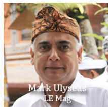
( https://liveencounters.net/2020/06/24/live-encounters-limited-edition-encounters-limited-edition-encounters-limited-edition-encounters-limited-edition/ )