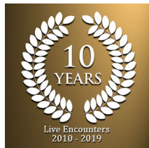
( https://liveencounters.net/live-encounters-celebrates/live-encounters-celebrates/live-encounters-celebrates/ )